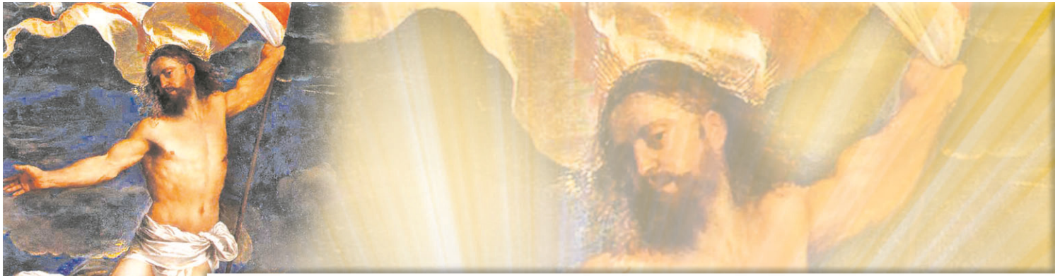
Vecellio Tiziano Circa 1520-1522